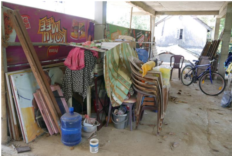
▲ putting furniture on the high story