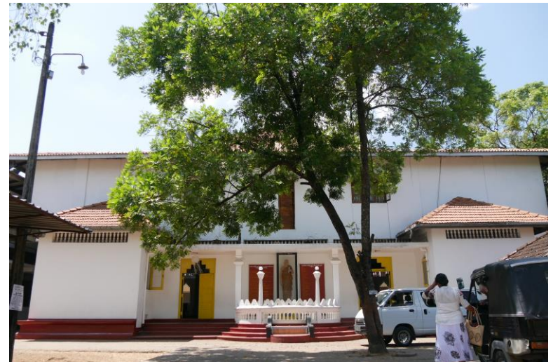
▲ local temple on a small hill